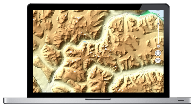
Arctic DEM – digital elevation model

Find, view and analyze – exchange and share data – create your own maps